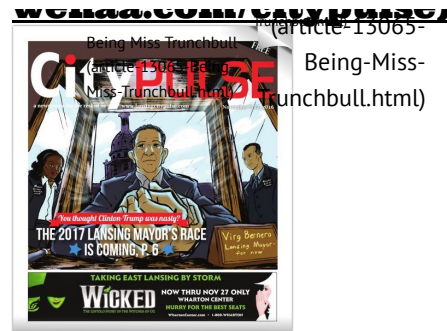
( http://npaper-wehaa.com/citypulse/ )

Arts and Culture ... Slow burn ( http://lansingcitypulse.com/articles/13818-Slow-burn.html ) Oct. 5 2016