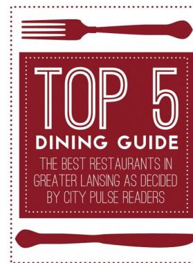
( flex-187-topfive.html )